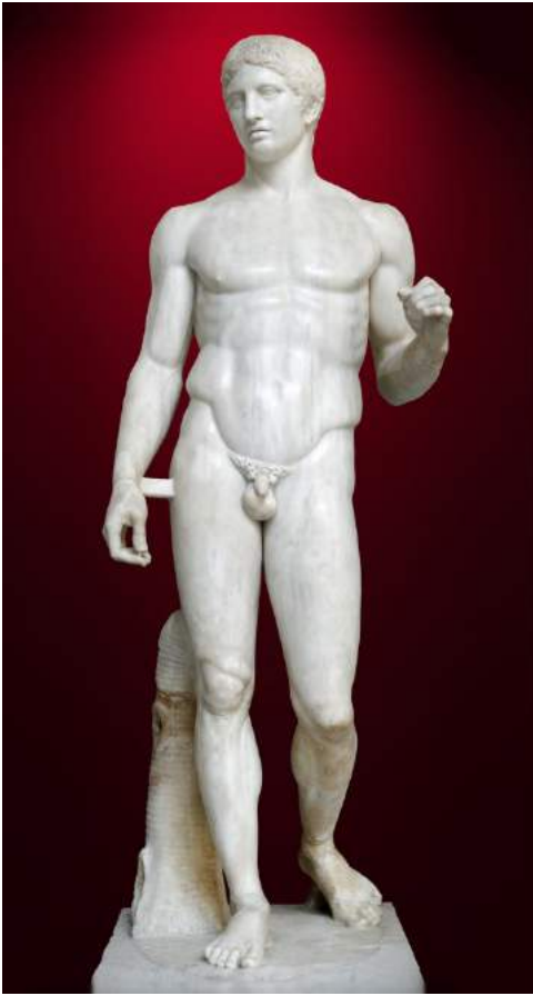
Doryphorus (The Spear Bearer) c440BCE