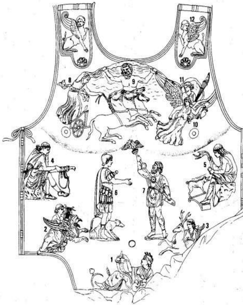
Identify the elements on the cuirass (breastplate)