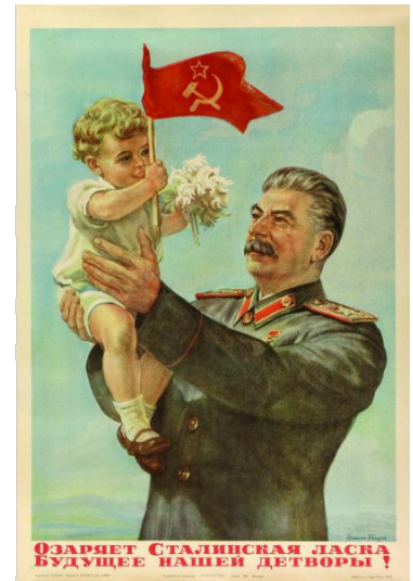
Joseph Stalin, Premier of the Soviet Union

Q: When considering the ' Continuous Profile (Head of Mussolini) ', how significant is the importance of a likeness or similarity between the subject and the work of art?