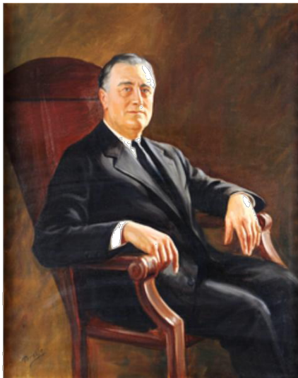
Franklin D. Roosevelt, U.S President.