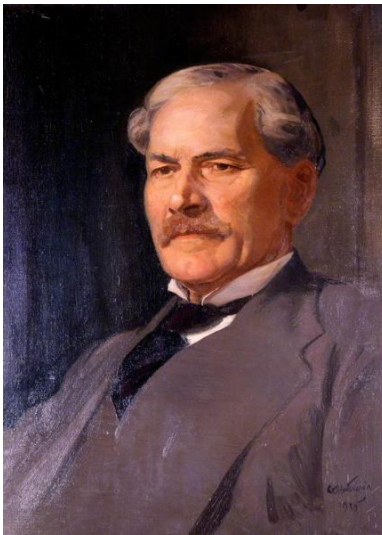
Ramsay MacDonald, PM Great Britain.

Q: How does this portrait differ from portraits of leaders of the period? See below