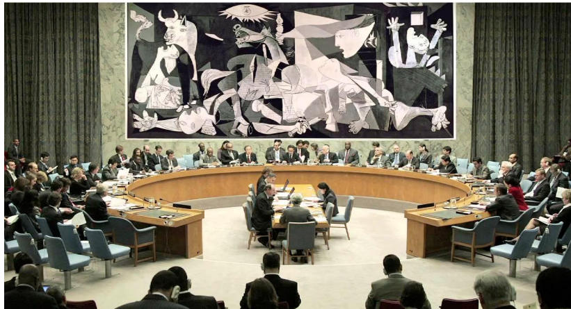
Guernica tapestry in the United Nations

A tapestry version of the work was produced in 1955 and displayed at the United Nations Buildings in NYC from 1985. The image is seen as a symbol warning against the destruction effects of war on humanity and civilisation. In 2003, then Secretary of State, Colin Powell gave a press conference at the United Nations presenting a case for why the United States should go to war against Iraq. The tapestry of Guernica hanging behind Powell was covered by a blue curtain. Many critics and observers speculated this was a deliberate decision to conceal an image of violence at a time when Western powers were seeking justifications for going to war against the Middle East.